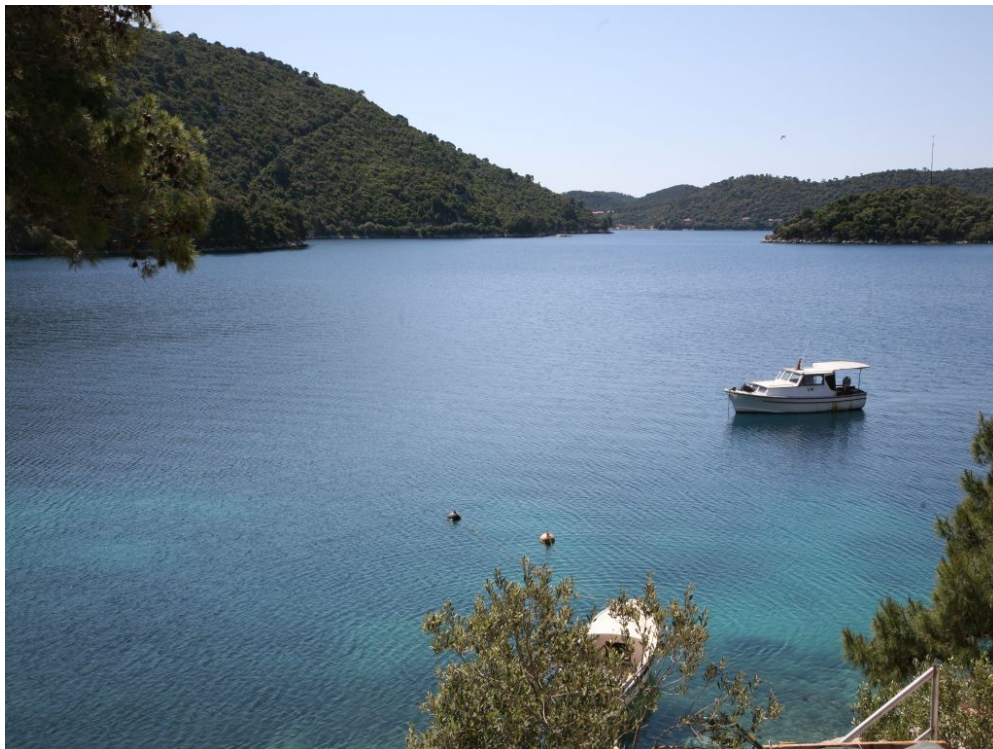
Lastovo, Pasadur

On the web site of Lastovo Tourist Office www.lastovo-tz.net one can read: